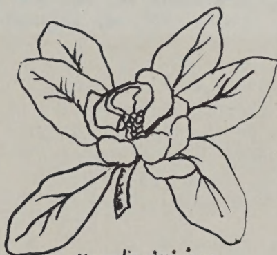
Magnolia virginiana SWEET BAY